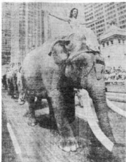
A scene from the 1982 Chicago Circus Parade as presented by the Circus World Museum of Baraboo, Wisc.