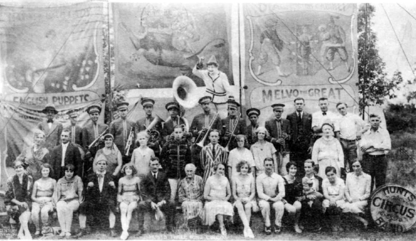
HUNT BROS. CIRCUS - Matawan, N. J. - Aug. 1, 1929