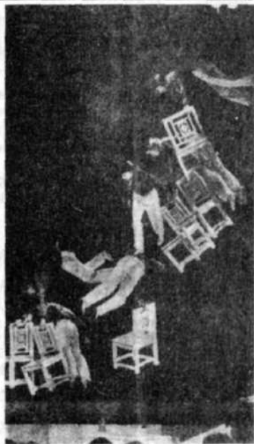
HANGING IN THERE - acrobats in The Great Circus of China opening show at Vancouver, BC, (Mar. 16) stay calm as their great Tower of the Chairs falls apart. Support cables hold them in mid air, preventing a serious accident. They went back and then completed the unusual feat. (From the Vancouver Sun of Mar. 17, 1982)