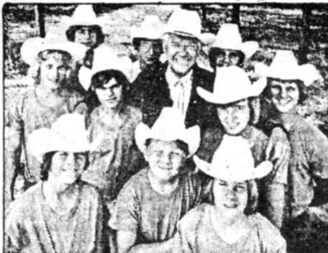
REAL-LIFE HERO: Kirby Grant at his ranch with teenage boys to whom he's given a new life.

But the insurance company went broke and left Grant pondering what to do with his future. "That's when I told my wife I was going to take a