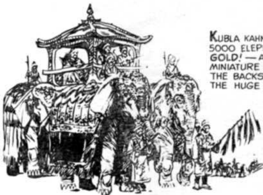
KUBLA KAHN DRESSED HIS 5000 ELEPHANTS IN PURE GOLD! —AND RODE IN A MINIATURE PALACE ON THE BACKS OF FOUR OF THE HUGE BEASTS!