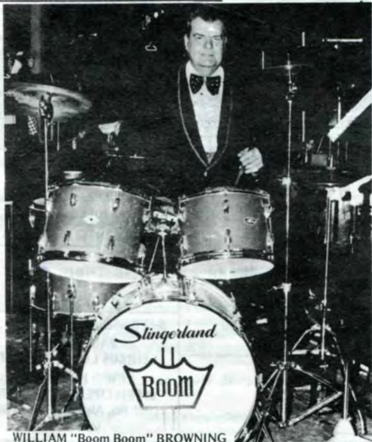
WILLIAM "Boom Boom" BROWNING

AMERICA'S FAVORITE CIRCUS WEEKLY OUR 12th YEAR