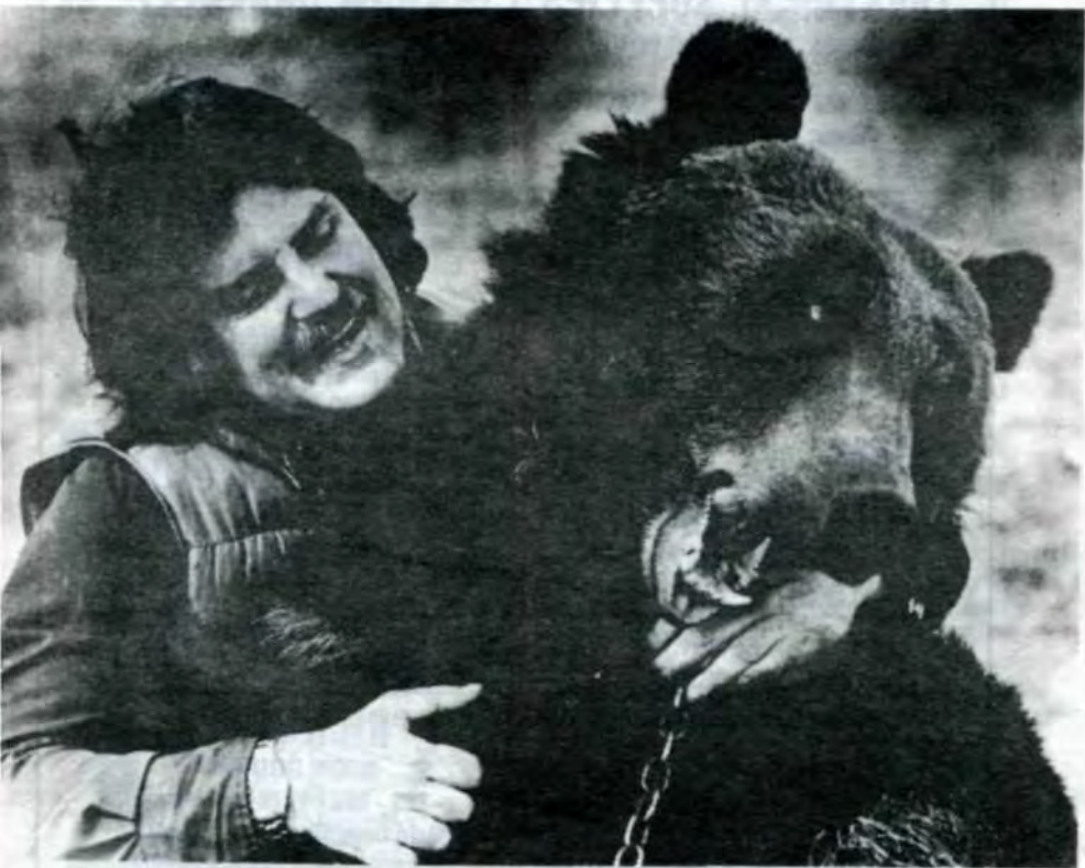
"JADIE" from the Grizzly Adams Show