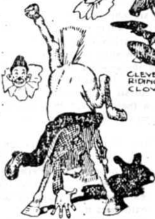
DR. WHITE, THE PONY, DID SOME GROUND AND LOFTY BUCKING **