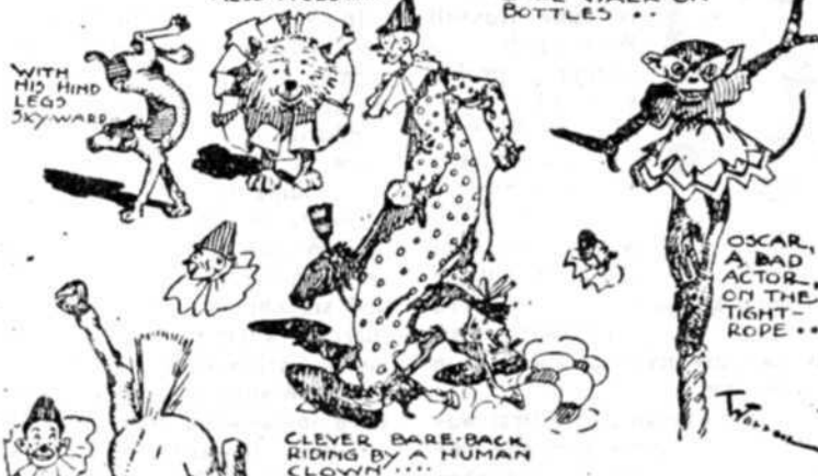
WITH HIS HIND LEGS SKYWARD