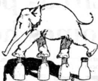
FARGO DID THE CAKE WALK ON BOTTLES **