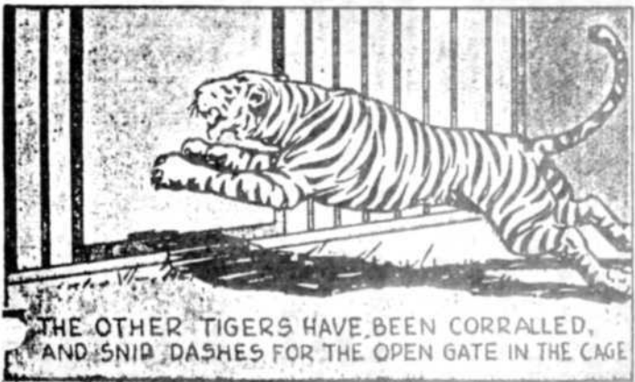
THE OTHER TIGERS HAVE BEEN CORRALLED, AND SNIP DASHES FOR THE OPEN GATE IN THE CAGE