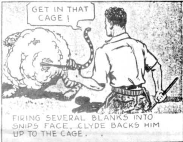
FIRING SEVERAL BLANKS INTO SNIP'S FACE, CLYDE BACKS HIM UP TO THE CAGE.