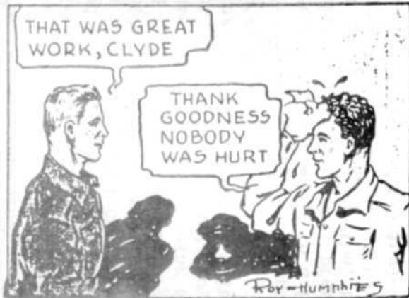
THAT WAS GREAT WORK, CLYDE