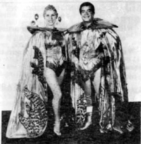
A HANGING PERCH SPECTACULAR . . . . . (Formerly with Circus Vargas)