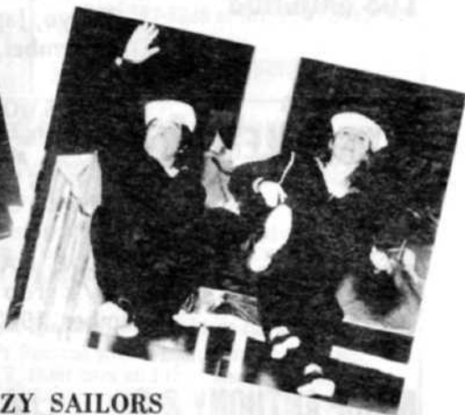
THE CRAZY SAILORS Comedy Acrobatics

Currently: Christmas Club Date Shows on the West Coast