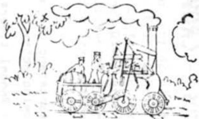
AMERICA'S FIRST PRACTICAL LOCOMOTIVE