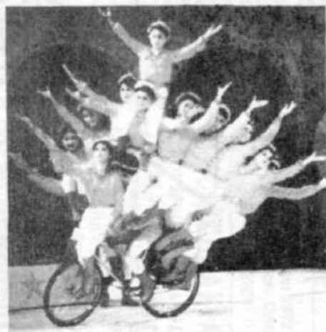
The Popular Bicycle Act