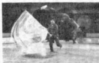
Display of Martial Arts