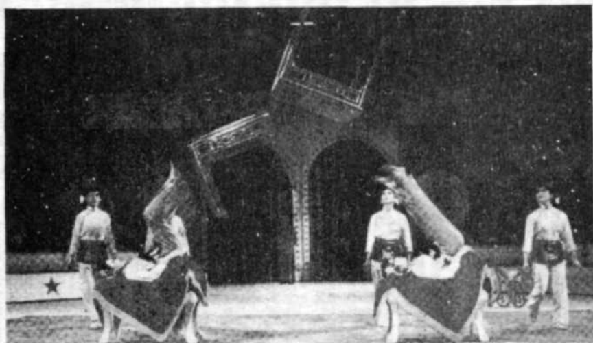
The Foot Jugglers