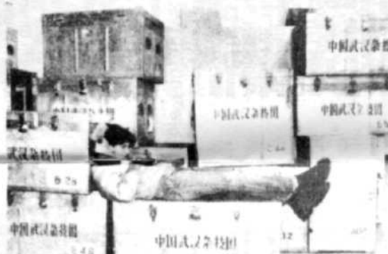
Worker Asleep on some Circus Trunks