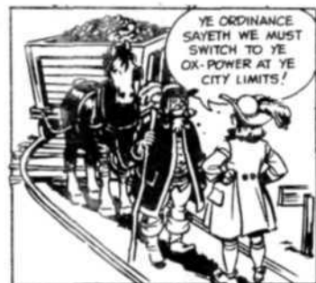
RAILWAY FREIGHT HAULING BEGAN IN 17TH CENTURY ENGLAND. COAL WAS MOVED FROM MINE TO BARGE BY HORSE-DRAWN CARTS OVER WOODEN OR CAST IRON RAILS!

Let's all be a bit more ethical, or one of these days "There 'ain't' gonna be anymore pictorials, no how!"