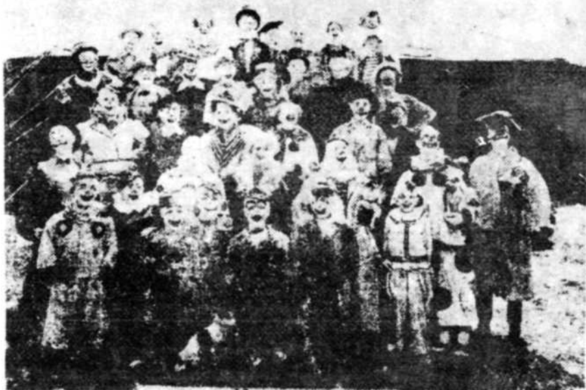
Ringling-Barnum About 1939/1940