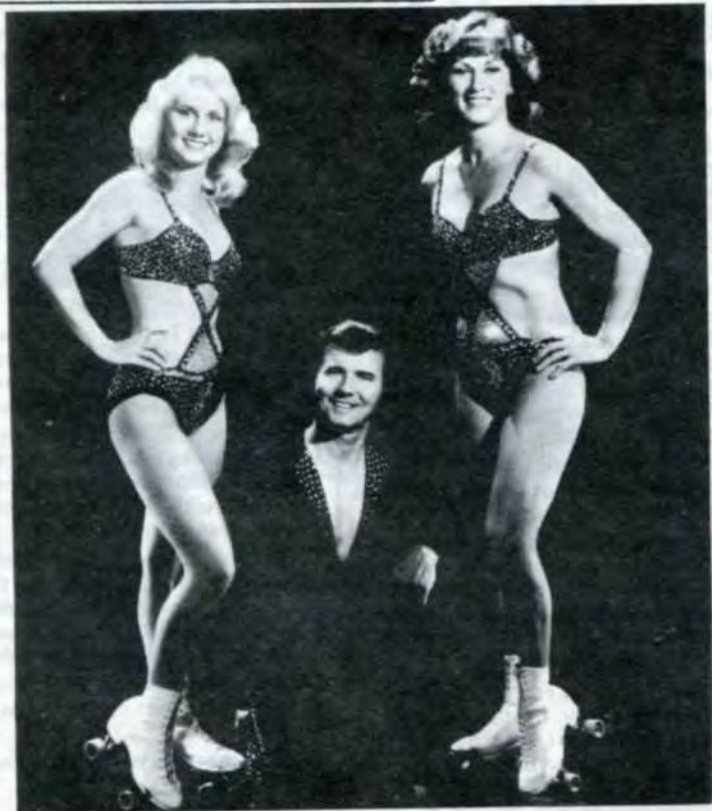
THE ROLLING DIAMONDS