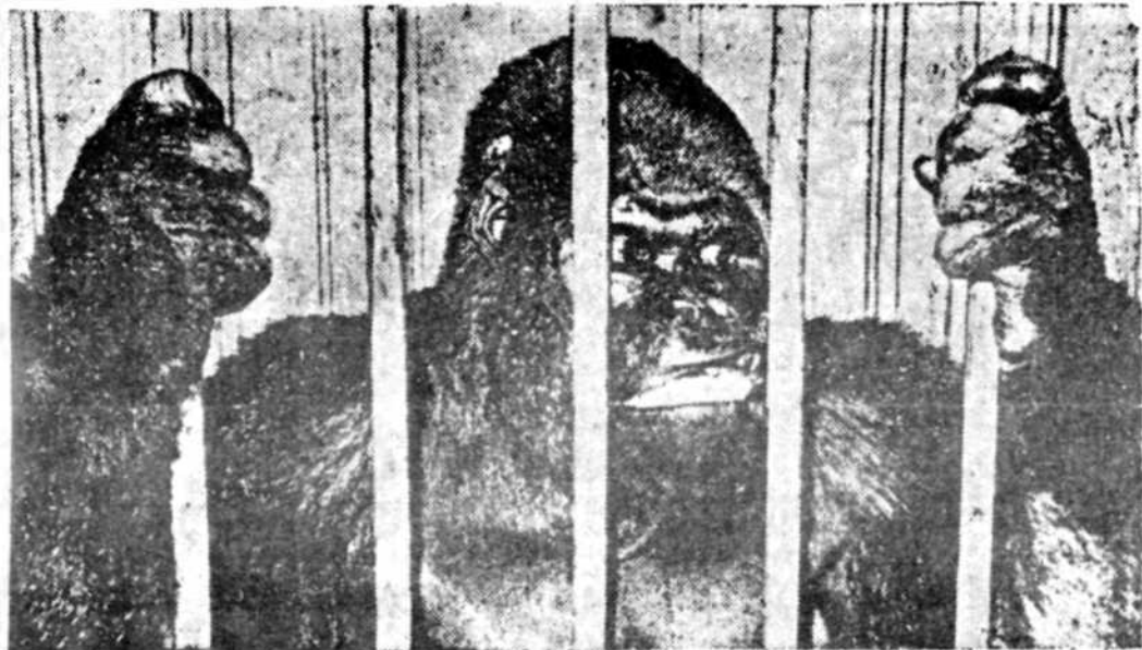
"Gargantua," the famous attraction with Ringling-Barnum is shown here in an ugly mood, as photographed in 1939.