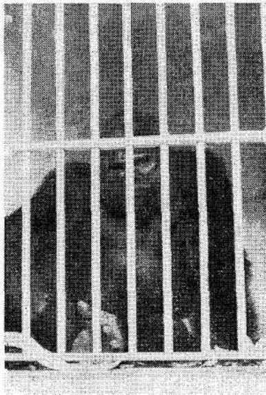
GARGANTUA THE GREAT

On November 25th, the "circus world" and entire nation were shocked by the announcement that Gargantua was dead. Not since the death of the famed elephant Jumbo, has the circus lost such a