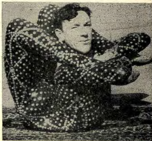
THE GREAT AITKEN