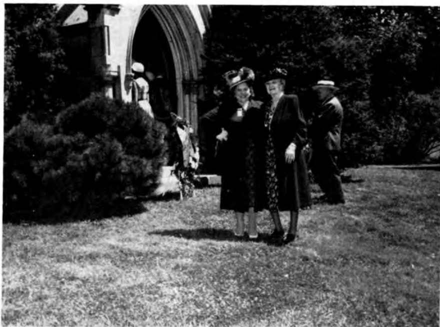
Photo taken at Spring Grove Cemetery