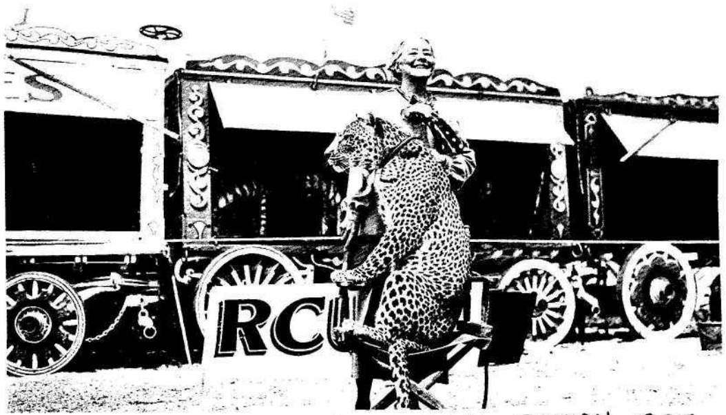
MABEL STARK 1935